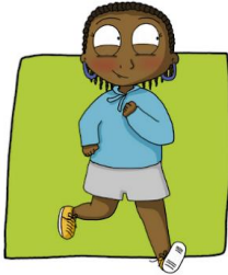
EXERCISE (JUST MOVE!)