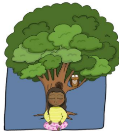
BE IN NATURE