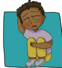
A GOOD CRY